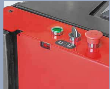
Automatic picking functions (OPT) enable all kind of loads to be lifted or lower quickly and without fatigue