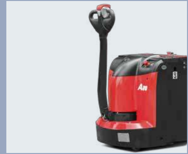
The truck benefits from a long tiller with a low mounting point ensuring a large safety clearance between operator & chassis