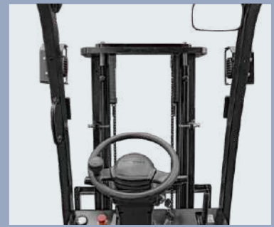
Wide view mast

/ The optimized design of the wide-view mast and the low dashboard enable a wide front view and higher safety, and minimizes the blind view to the greatest extent. / The emergency power-off switch complies with European safety standards. / The electronic and hydraulic overload protection comply with safety regulations. / OPS system(Opt.) can improve safety greatly.