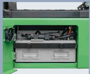
Lithium battery pack